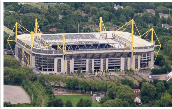
Strobelallee 50, 44139 Dortmund Entry: Foyer West

The admission to the event room is via the Foyer West. You can reach Foyer West by foot. Use the elevators in foyer West to get to the 4th floor.