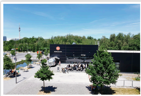
Phönixplatz 4, 44263 Dortmund Phoenix des Lumières (Vorplatz), am „Hüttenmann“