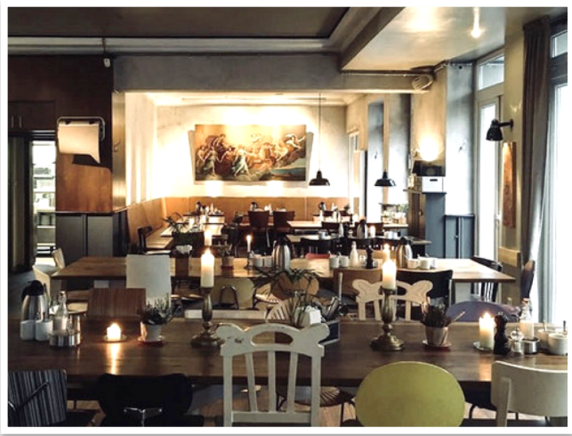
Liebigstraße 23, 44139 Dortmund