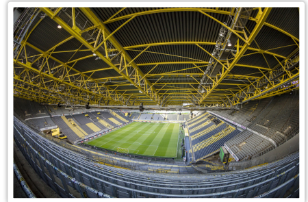
Strobelallee 50, 44139 Dortmund Entry: Foyer West